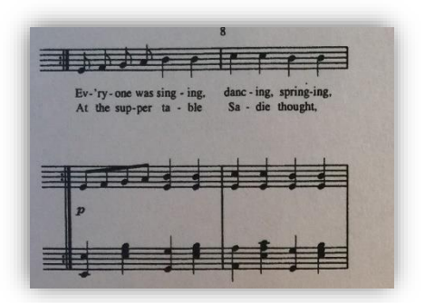
"Yiddle on Your Fiddle, Play Some Ragtime"

Secondly, the bridge or middle section of the song emphasizes what could only be called a musical and emotional curiosity. Magee continues: