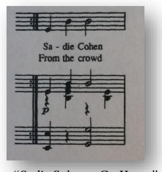
"Sadie Salome, Go Home"